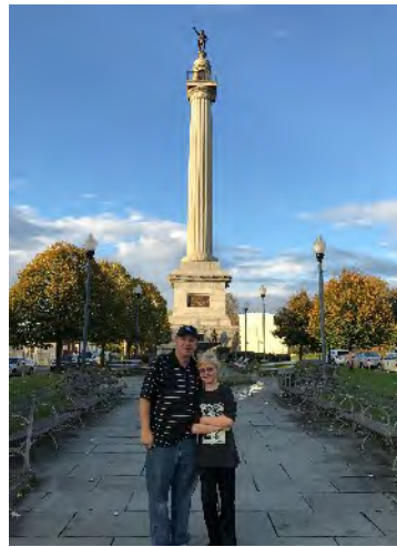
BATTLE OF TRENTON December 26, 1776