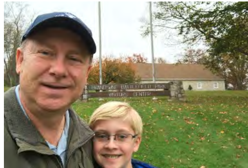
BATTLE OF BRANDYWINE September 11, 1777