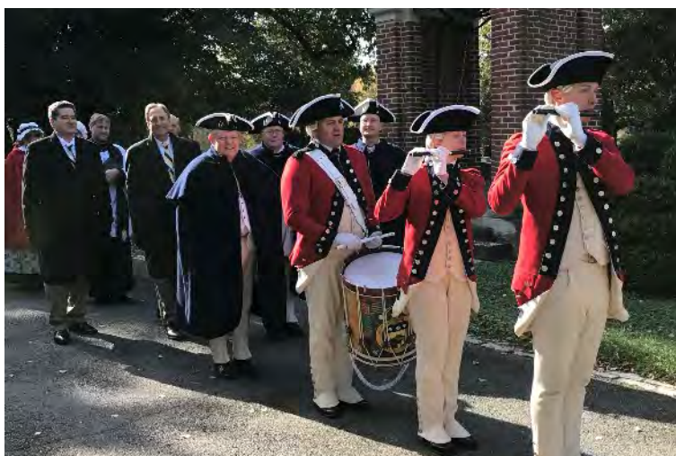
U.S. ARMY FIFE AND DRUM

The U.S. Army Fife and Drum, followed by the Fairfax Resolves Color Guard, led the procession to the new highway marker after the dedication ceremony on the steps of Pohick Church. Following the unveiling of the highway marker, the procession continued to the gravesite of General William Brown, MD.