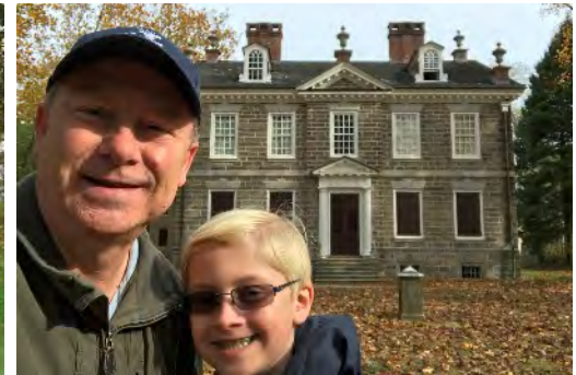
BATTLE OF GERMANTOWN October 4, 1777