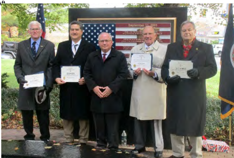
SAR MILITARY SERVICE MEDALS