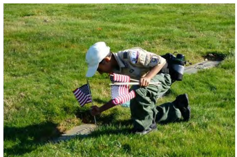
FLAG PLACEMENT WITH SCOUTS