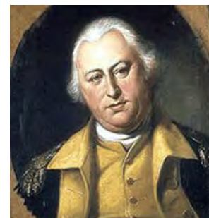
Major General Lincoln