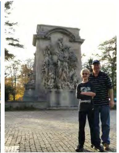
BATTLE OF PRINCETON January 3, 1777