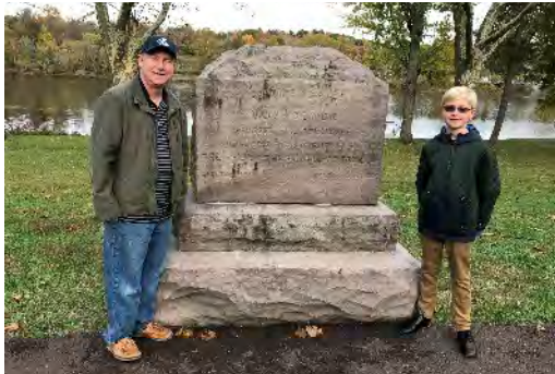
WASHINGTON CROSSING HISTORIC PARK