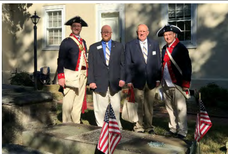
GRAVE OF GOVERNOR THOMAS NELSON, JR.