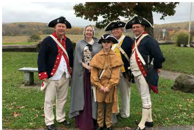
VIRGINIA DAY MEMORIAL SERVICE AT VALLEY FORGE